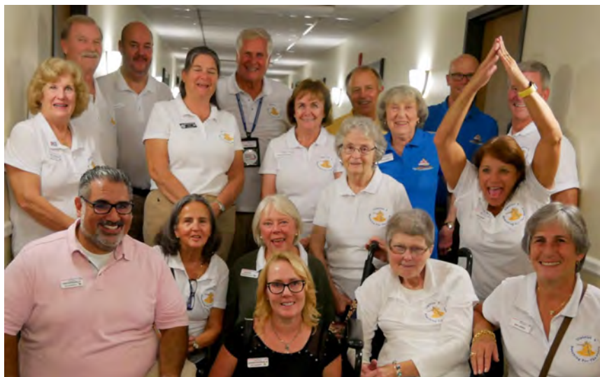
District Aides at Fall Conference

19-26 Feb USPS Annual Meeting Rosen Plaza, Orlando, FL 2-6 Mar Atlantic City Indoor Boat Show AC Convention Center 30 Mar-2 Apr District 5 Spring Conference Princess Royale, OC, MD