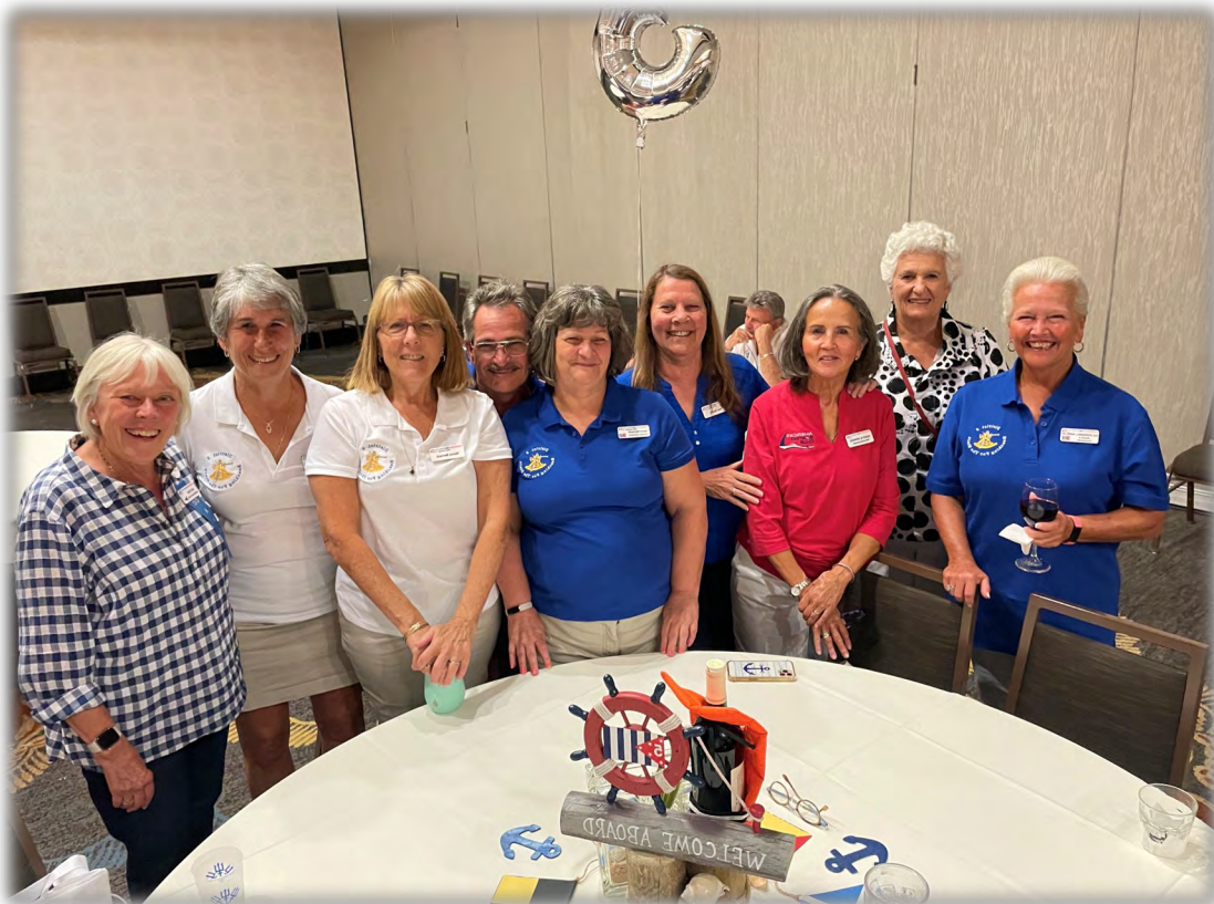
District 5 Hospitality Table at the Fall Governing Board in Raleigh

Cat's Pajama's! The bees knees! Speakeasies and flappers! Not many of us may remember these terms or the era, but here's a chance to put our spin on those Roaring 20's days! So knock on the "green door" for a great dinner and an evening of fun to close out a week of education, meetings, and camaraderie!